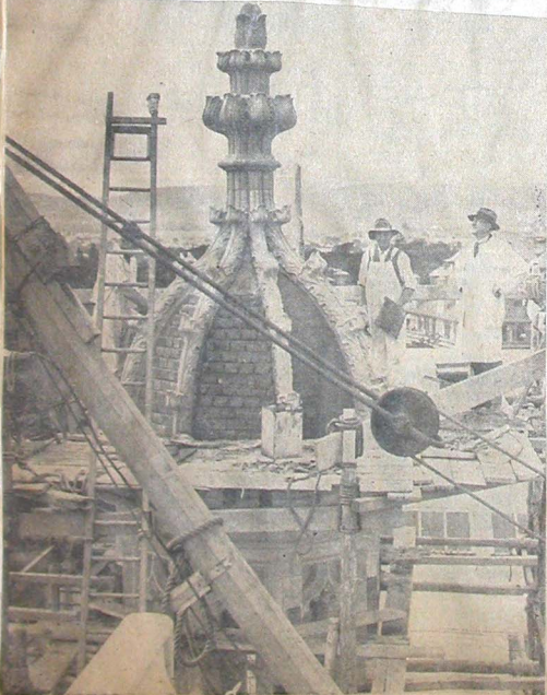
TRADESMEN engaged on the ornamental work of the north-eastern tower of the Bonnython on North terrace, Adelaide. The stonework of the building will be completed towards the end of next month.

Advertisement for 'United Package' featuring a large illustration of a white sack and descriptive text.