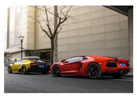
Lamborghinis parked in a street in Shanghai

In the countryside, the revival of rural markets in the late-1970s meant that farmers were again allowed to sell produce for profit. Rural entrepreneurs soon emerged, many of whom had been landlords or successful farmers before losing everything to revolutionary land redistribution in the