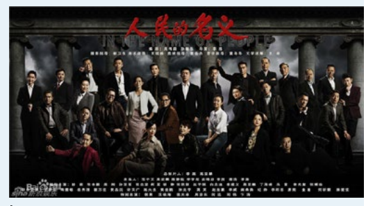
Promotional material for In the Name of the People

The anti-corruption television drama In the Name of the People 人民的名义 was a massive hit in 2017, gripping audiences from the broadcast of the first episode in March. The fifty-two-episode drama, based on a novel by Zhou Meisen 周梅森,had captured a record ten per cent average of Chinese viewers nationally, rack-