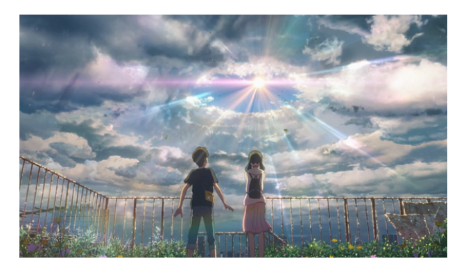
Spiritual Image in Weathering with You ©2019 Tenkinoko Sakusei Iinkai<sup>44</sup>

travel between both worlds in both Weathering with You and Your Name.