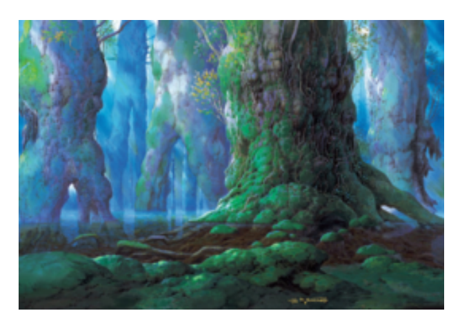
'The Forest of Shishigami no.5' in Princess Mononoke ©1997 Nibariki]GND/Yamamoto Nizo

not just myself - is the way we depict nature. We don't subordinate the natural setting to the characters. Our way of thinking is that nature exists and human beings exist within it. ... That is because we feel that the world is beautiful. Human relationships are not the only thing that is interesting. We think that weather, time, rays of light, plants, water, and wind what makes up the landscape - are all beautiful. That is why we make efforts to incorporate them as much as possible in our work (emphasis added).<sup>50</sup>