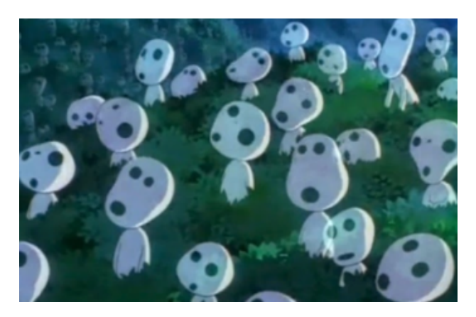
Kodama ©1997 Studio Ghibli

I wondered how to give shape to the image of the forest, from the time when it was not a collection of plants but had a spiritual meaning as well . I didn't want the forest just to have many tall trees or be full of darkness. I wanted to express the feeling of mysteriousness that one feels when stepping into a forest - the feeling that something is watching from somewhere or the strange sound that one can hear from somewhere. When I mulled over how I could give form to that feeling, I thought of the kodama. Those who can see them do, and those who can't don't see them. They appear and disappear as a presence beyond good or evil.<sup>53</sup>