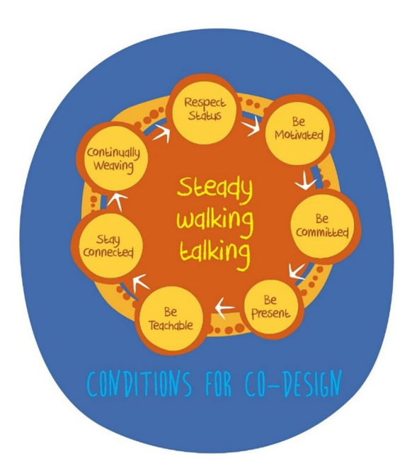
Figure 1 Steady Walking Talking co-design framework.

This research addresses the lack of cultural security (which affects the accessibility and responsiveness of youth mental health services) and culturally appropriate evaluation tools to determine the effectiveness of services in meeting the needs of Aboriginal young people. The intended outputs and outcomes will occur through a culturally grounded, relationship-based process that will create and sustain partnerships with Aboriginal Elders, young people and youth mental health service staff. Participants will work together to co-design appropriate service models, system change interventions and evaluation tools to measure organisational change. Unique to this project is the drawing together of cultural protocols and research to develop innovative, decolonised service provision to improve the social and emotional well-being of Aboriginal youth. (the term 'Aboriginal' has been used in this article to refer to both the Aboriginal and Torres Strait Islander peoples of Australia. Our intention in using 'Aboriginal' is to acknowledge the significance of place and that this project will be conducted on Aboriginal country in Western Australia with different clan groups. The authors acknowledge that Aboriginal and Torres Strait Islander peoples may