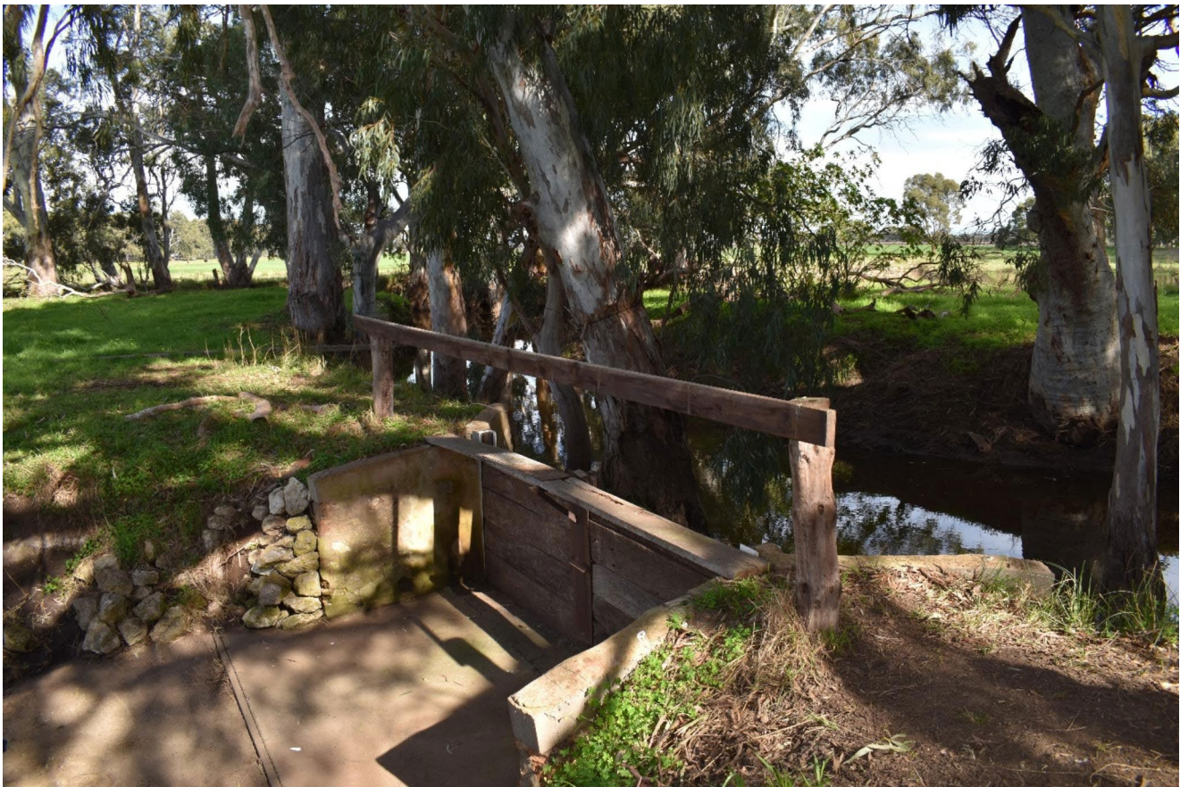
Fig. 2 Flood gates on a distributary offshoot of the Bremer

floodgate there, and we’ve got a floodgate just up here, just a small one. So, what we do is we back the water up in [this block] until it’s full. And then we start opening up boards. And that comes down through here, down through that section, and down the back of the winery. And then it all sort of just fills up.