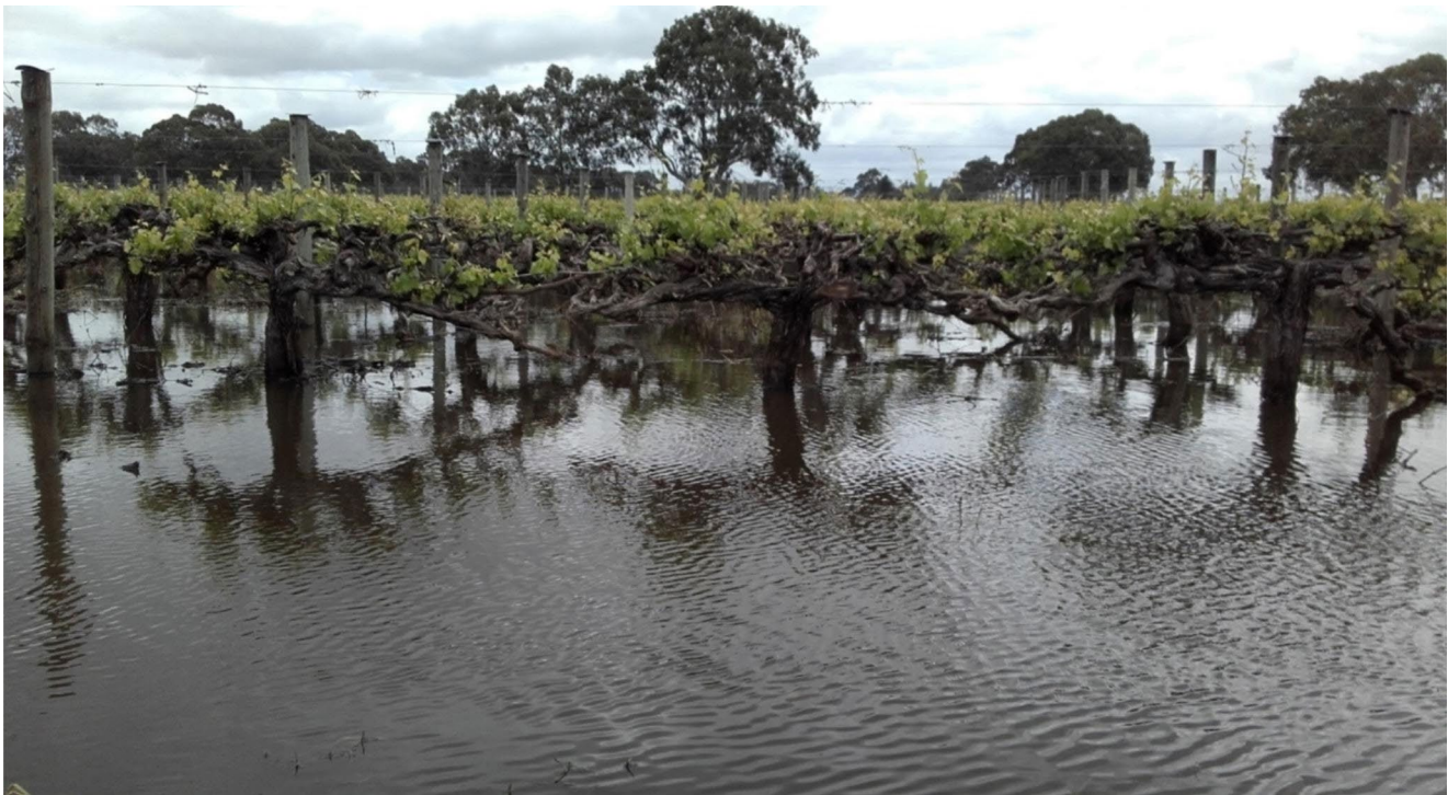
Fig. 3 A flooded vineyard