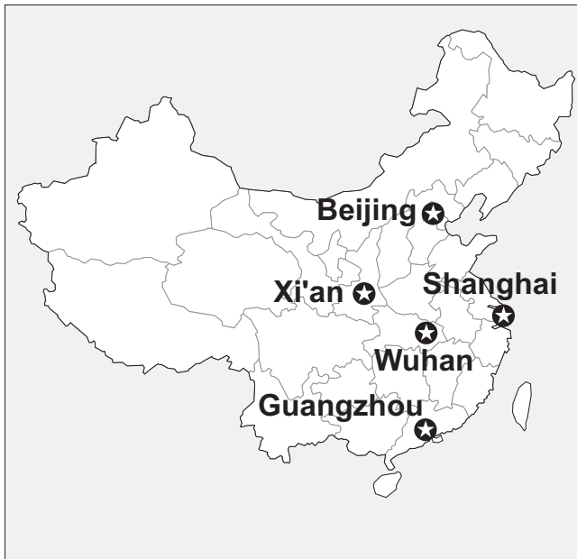
Figure 1 The five study regions in China.

areas were randomly sampled from the urban blocks, and one or more villages from the rural townships.