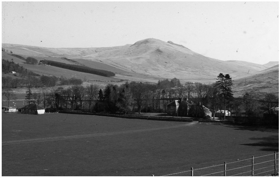
Figure 2. Inbye (foreground) and outbye land.

The terrain of Teviotdale consists of hills reaching 600 meters at the watershed and gradually decreasing in height and density with the widening of the valley as one moves in a north-easterly direction toward Hawick. There are two types of land—"outbye," hill or rough grazing, and "inbye," park or improved grassland (see Figure 2). The two are differentiated in terms of weather conditions, topography, soil, vegetation, and the consequent affordance for rearing sheep. All farms in the valley have some of both types of land. The nine larger farms (over 500 hectares) on the higher ground nearer the watershed have a greater proportion of hill land (more than 75%), and the six smaller farms nearer Hawick on generally lower ground have a smaller proportion of hill land (less than 50%).